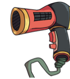
push button switch